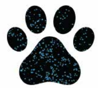
Unprotected Surface After 24 Hours